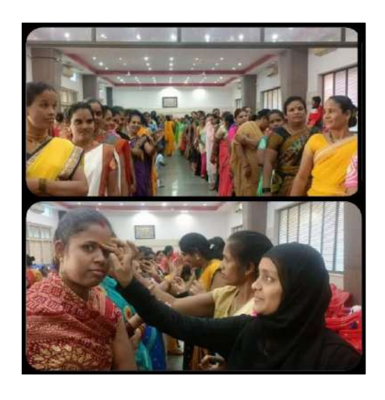
A small celebration on Women's day

Throughout the year, various programs for women are organized. More than 100 women participated in programs such as Haldi kumkum and Women's Day. During the meeting, the emphasis was on breaking their boundaries and not limiting themselves. They have to acquire new skills. They attended a workshop on stress management, saving, spending time with children, dealing with difficult situations in the family, and resolving group conflict.